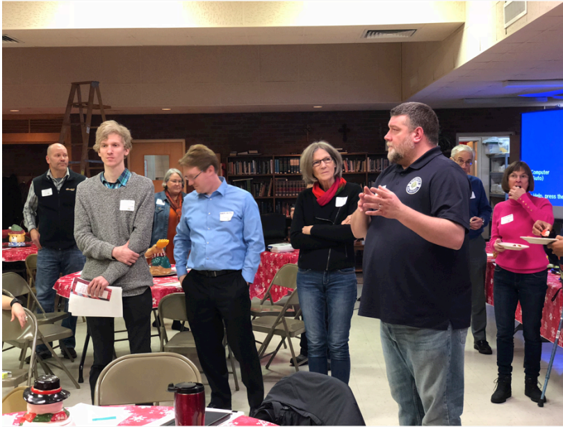
Community asset mapping participants gather to share ideas generated during the morning's session

Partners for Sacred Places and the ABCD model was followed by two smaller group breakout sessions facilitated by Partners' staff. Using the ABCD model and asset mapping tools, each small group identified strengths - "assets" - of First Presbyterian Church. These assets were drawn from the building's design, location, and human capital invested in its preservation. Next, the groups identified the assets of Springfield and greater Sangamon County, including its associations, institutions, economy, stories, and physical and individual strengths. The groups then brainstormed new ideas for collaboration,